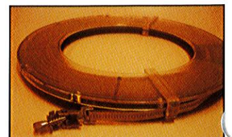
Flexible Duct Banding Stainless Steel 30m x 9mm Roll within Plastic Dispenser Product Code # 1112

For further information please contact your local representative. Specifications subject to change without notice