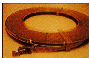
Stainless Steel Banding within Plastic Dispenser Product Code # 1112